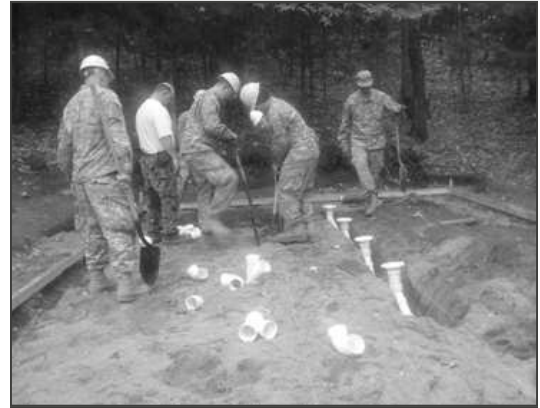
The National Guard crew from Wagner, SD works on the new toilet/shower house near the Spotted Tail camp site.

The second project is to build a new flush toilet and shower facility near the Spotted Tail campsite. This facility will primarily serve the Spotted Tail, Red Cloud, and Sitting Bull campsites. The project calls for a facility that will have individual toilet closets on one side and individual shower closets on the other. A common sink will be set on one end of the facility to accommodate hand washing. This layout is similar to the toilet facility near the Administration Building, except will have showers on the one side. The purpose of the new facility is to take some of the pressure off of the existing west shower house and to begin phasing it out completely. The hope is to build this one this year, and build others around camp, as money is available. One day we will have several of these type facilities on both sides of the camp property.