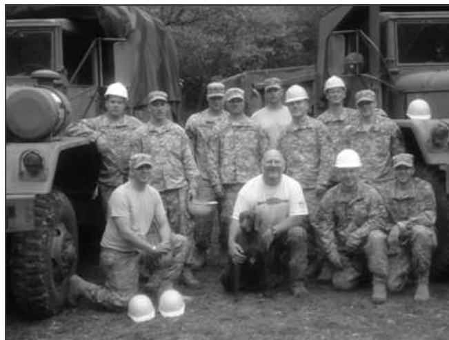
National Guard Building Crew from Wagner, SD

Male or Female, 15 years and older, dependable, willingness to help others, friendly, and responsible. Expected to live the Scout Oath and Law. Must have a complete uniform.