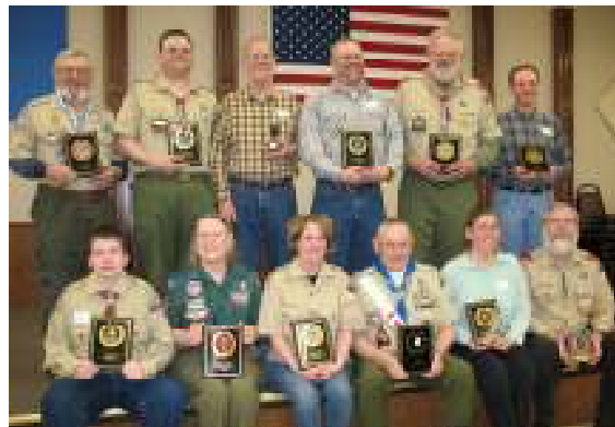
07 Dist. Award Winners Photo