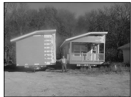
The sections of one of two manufactured houses to be used in the Staff Housing/MRHAB project is delivered to L & C Scout Camp.