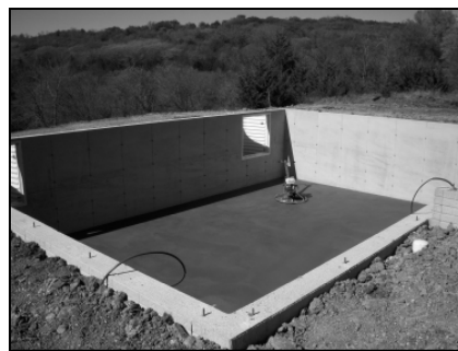
Completed basement for one MRHAB housing unit which will also serve as a severe weather shelter.