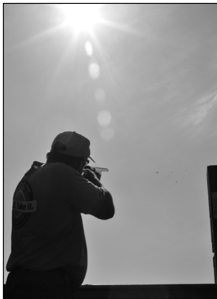
A shooter from RAS who hit the clay pigeon.