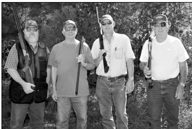
First place: Team Raven

Next year's Shoot Out event will be held Tuesday, September 20, 2011. We invite everyone to put together a team and come have a great time supporting the Scouts of the Sioux Council.