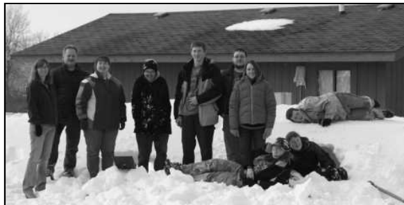
Venturer's who camped at L&C on January 16-17, 2010