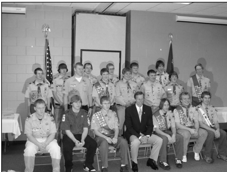
2009 Eagle Scouts with Senator John Thune.