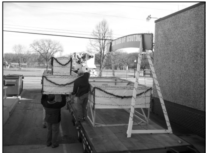
Prepping the float on the day of the parade.