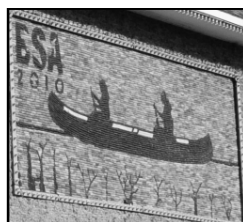
Boy Scout Mural

The Corn palace is the worlds largest building that uses corn and native plants as decorations. The murals are changed yearly. For those of you who have not taken time to view the Corn Palace this year would be a great opportunity to stop and have a look. For those of you who are history buffs, the Corn Palace has a complete pictorial history of past years murals on display inside the complex.