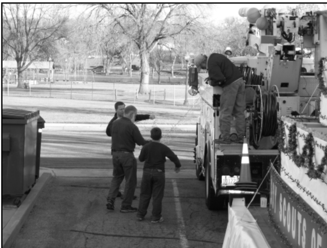
Decorating the Xcel Energy truck for the parade.

Thank you to all the dedicated Scouts and Scouters who spent many nights and weekends working to create an exciting and impressive display of Scouting for the community. A special thanks as well to all the enthusiastic Scouts and Scouters that participated in the parade. Your efforts helped create a float that was selected by the parade judges as the entry with the "Best Use of Lights!" If you haven't seen the float, check out the Sioux Council website for pictures from the parade. Thanks again to all involved and we look forward to seeing you at next year's parade.