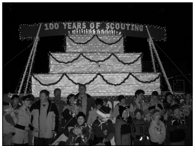
Scouts and Scouters who participated in the parade.