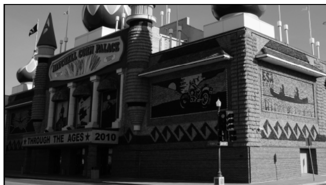
Mitchell Corn Palace—Boy Scout Mural on right.